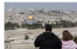
April 2, 2012 Mount of Olives