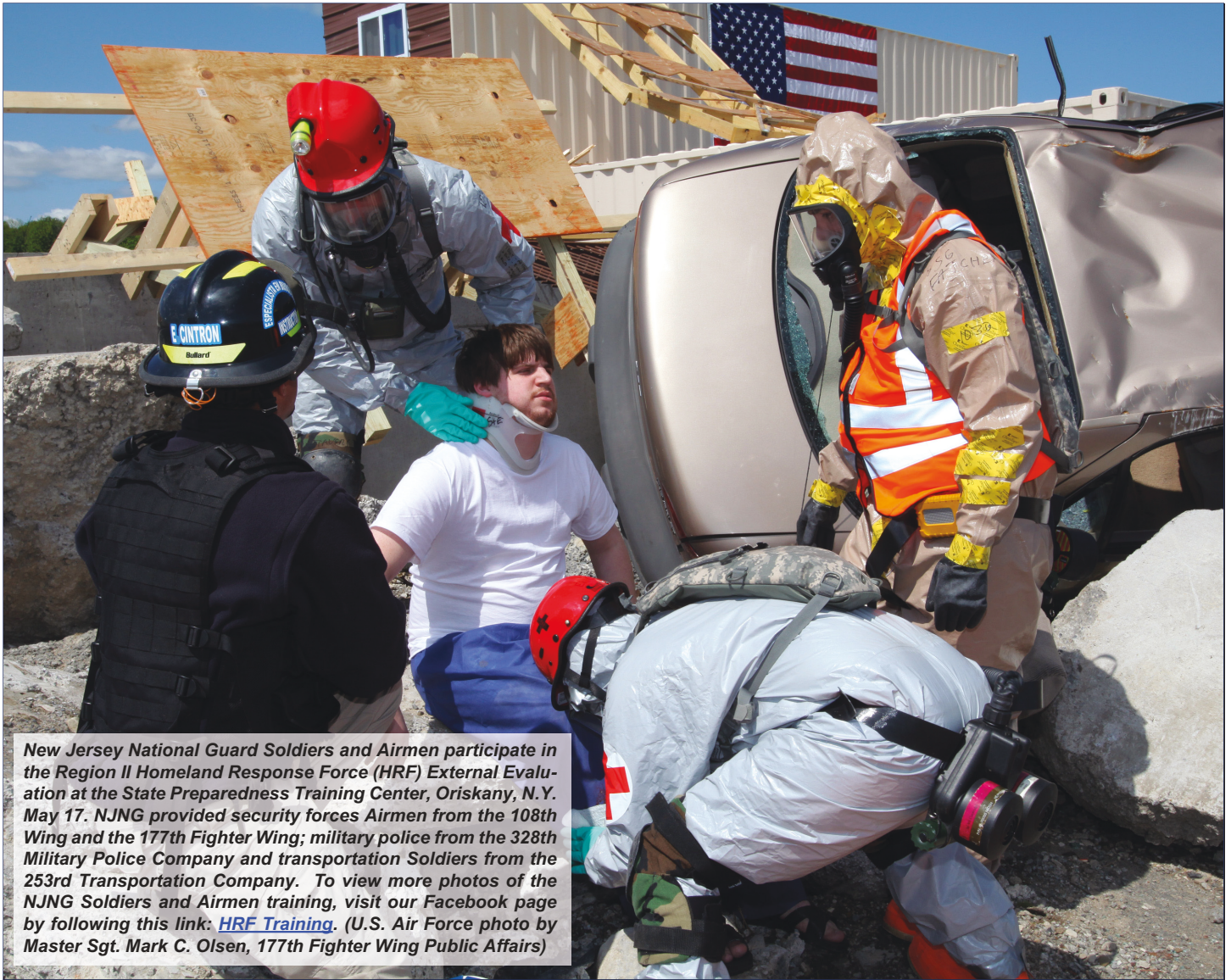
New Jersey National Guard Soldiers and Airmen participate in the Region II Homeland Response Force (HRF) External Evaluation at the State Preparedness Training Center, Oriskany, N.Y. May 17. NJNG provided security forces Airmen from the 108th Wing and the 177th Fighter Wing; military police from the 328th Military Police Company and transportation Soldiers from the 253rd Transportation Company. To view more photos of the NJNG Soldiers and Airmen training, visit our Facebook page by following this link: HRF Training.