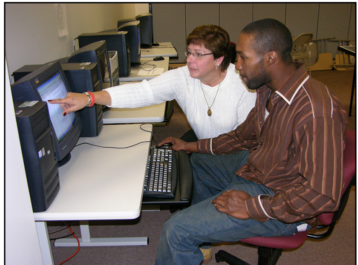
As part of the PEPP program, parolees learn resume writing, interviewing skills and internet job search techniques.

The program was launched in February, 2012. As of June 30, 2012 the Department of Labor has confirmed that the three employment provider agencies: Blessed Ministries covering the Northern Region, Shiloh Community Development Center covering the Central Region, along with the Mid-Atlantic State Career and Education Center covering the Southern Region, have either achieved or exceeded the employment performance benchmarks established by the Department of Labor.