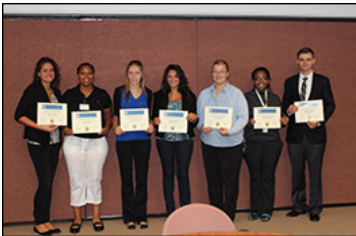
State Parole Board interns receive their completion certificates during a ceremony at the Board's Central Office in Trenton.

State Parole Board satellite offices throughout the state with 50 students completing their internships. Work sites included: district parole offices, central office headquarters, contracted community programs, and the Parole Board offices within the institutions. The internship program provides students, from state colleges and universities, the opportunity to gain knowledge and practical "on-the-job" experience while applying academic theories into workplace practices. The students work with experienced supervisors and staff to observe and assist in daily operation activities that helps prepare them for jobs in the criminal justice system and related fields, as well as offers them a platform for networking and building professional relationships. This program has proven to be a valuable resource for both the students and the agency.