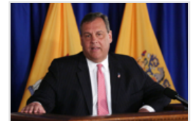
Horizon Health Care Presser Wednesday, June 21, 2017