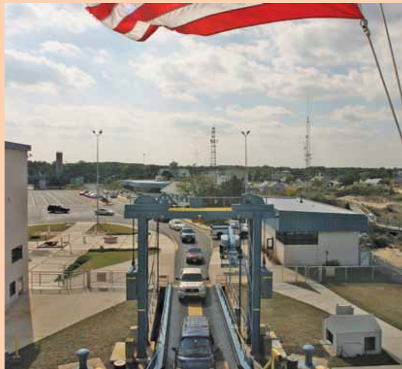
Vehicles on the loading ramp at Cape May Terminal

and demonstrations of how people lived in the 1800s. School groups are encouraged to visit this fascinating glimpse into the area's history. The Three Forts Ferry system saw an increase in ridership in 2008, up 6 percent over 2007's total, which was lower than usual due to renovation closures, to 24,057.