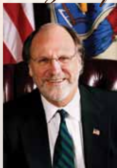
Governor Jon S. Corzine