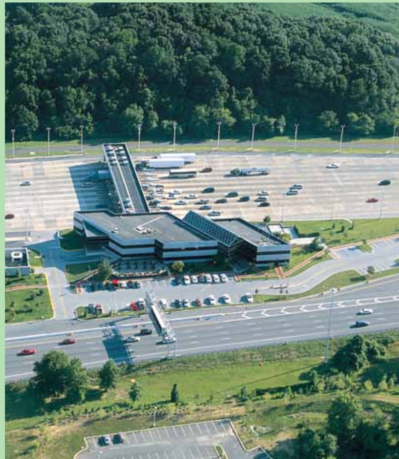
Delaware Memorial Bridge Toll Plaza

While the safety of the roads and bridges is paramount, the DRBA is also in the forefront of toll authorities in bringing toll evaders to justice. The State of Delaware enacted a new law that empowers the DRBA police as well as the Delaware state police to impound vehicles owned by toll-evaders. Once the owners repay the tolls, fines and administrative fees incurred, the vehicle is returned. Working closely with the State of Delaware, the Delaware Department of Transportation and the Delaware State Police, the Authority is cracking down on habitual toll violators. The new law is not aimed at the casual offender who receives a single violation notice. This law is targeted to those who flagrantly disregard their obligation to pay highway and bridge tolls.