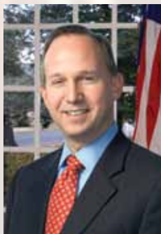
Governor Jack Markell

The mission of the Delaware River and Bay Authority is to provide safe, efficient and modern terminals, crossings, vessels and related transportation while participating in controlled economic development opportunities supported by a technically proficient and professionally motivated workforce dedicated to providing high quality customer service.