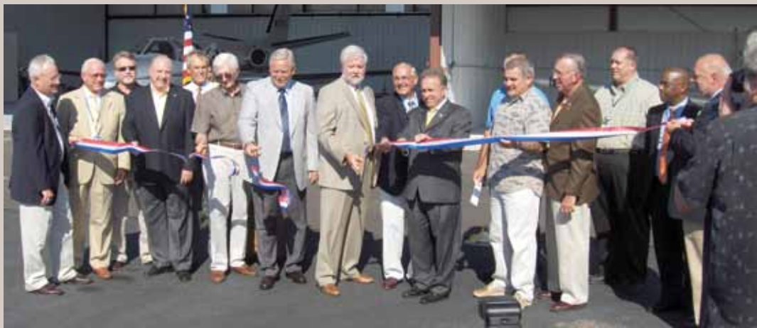
Ribbon-cutting ceremony at the new Cape May Airport hangar includes the developers, local officials and DRBA representatives.

Safety improvements, including removal of obstructing trees, were under taken at New Castle Airport and Delaware Air Park. As a result, both had runway repainting projects, while at New Castle, other runway improvements included new signage, lights, drainage and runway rehabilitation. The Federal Aviation Administration's (FAA) Safety and Certification Branch for the Eastern Region commended the Authority's Airport Operations and Maintenance Departments for their dedication and hard