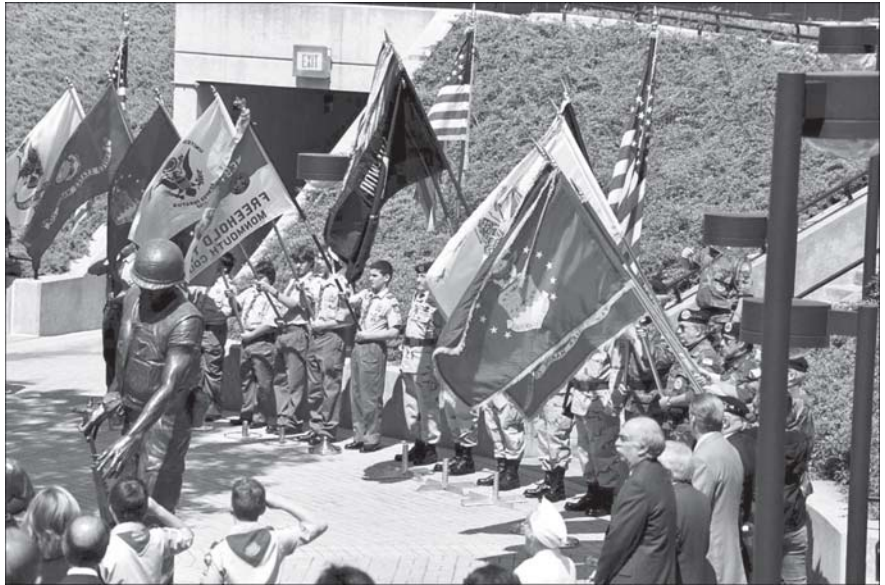
Chapter 800 of the Vietnam Veterans of America, the North Jersey Chapter of the 82nd Airborne Division Association, and Boy Scout Troop 155 of Freehold posted the colors at the Remembrance Day Ceremony.

It was announced that the New Jersey Vietnam Veterans' Memorial Foundation recently added three more names to the New Jersey Vietnam Veterans' Memo-