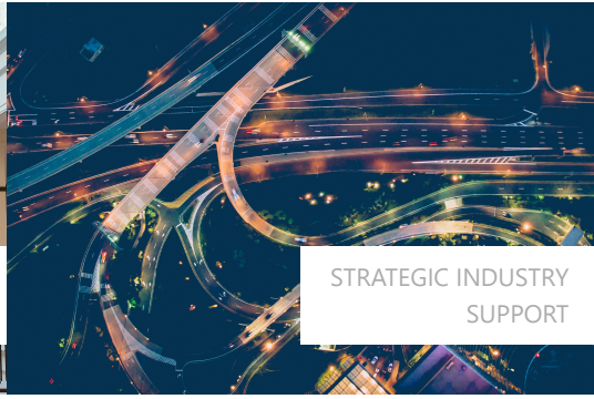
STRATEGIC INDUSTRY SUPPORT