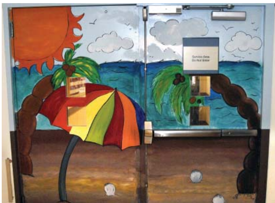
Left photo: Woodbridge High School art students painted murals on several doors of the special needs secured units at Menlo Park Veterans Memorial Home.

Other volunteer projects saw an Eagle Scout build faux brick rolling half walls for chapel services that spill out into town square and Woodbridge High School Art Students painted door murals on special needs secured units during the year.