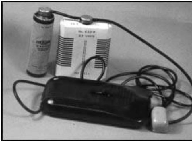
First Electrical Hearing Aid

1975: Interpreters were made available for Deaf and Hard of Hearing. Before that, children of parents who are Deaf interpreted for their parents only.