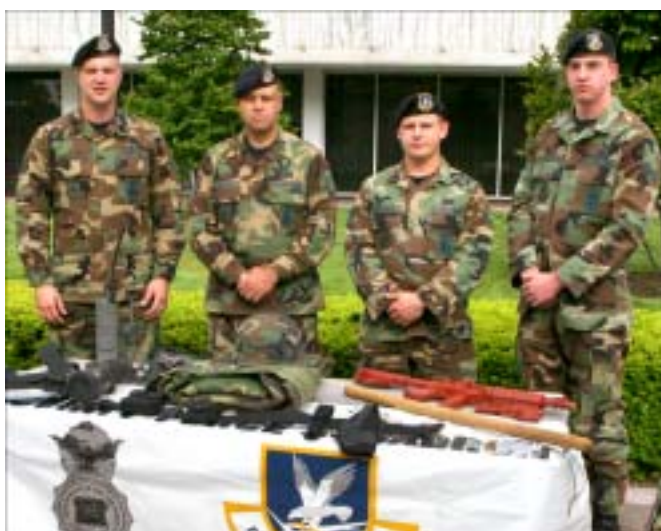
The 108th Air Refueling Wing Security Forces display was among the many Army and Air Guard exhibits.