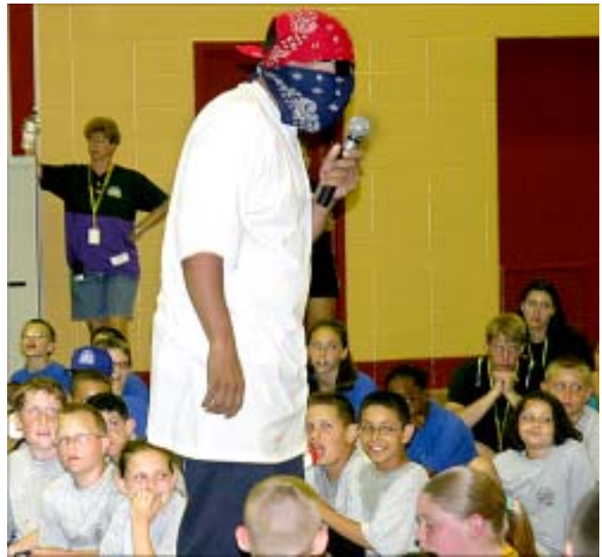
One of this year's activities was a lecture on gang awareness.

The weeklong camp is open to children and grandchildren of active and retired members of the New Jersey Army