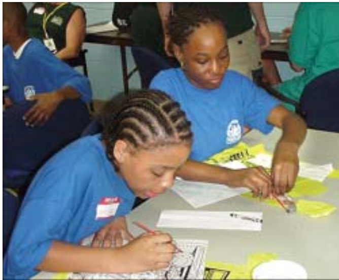
Arts and crafts were a popular activity among this pair of campers at this year's Youth Camp.

The campers aged 9-12 spent the week doing sports,