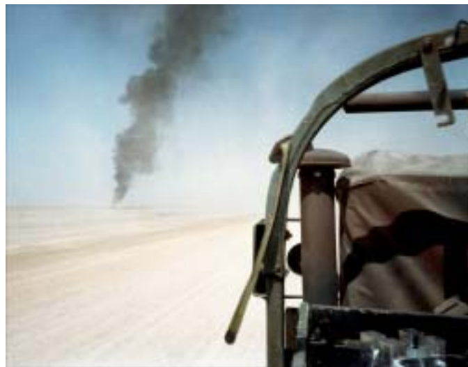
Burning oil breaks the monotony of a convoy.