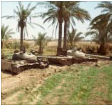
Abandoned Iraqi T-72s are some of the sights seen while on convoy duty.

Another day done, another day closer to our return. ♫