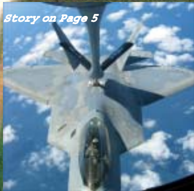
Story on Page 5