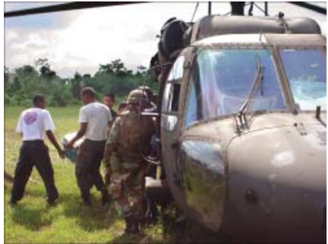
Aid workers and Guardsmen unload emergency relief supplies from a 150th GSAB Blackhawk at Boca de Cupe.

The success of the Darien airlift mission and the entire deployment rests on the teamwork between maintenance