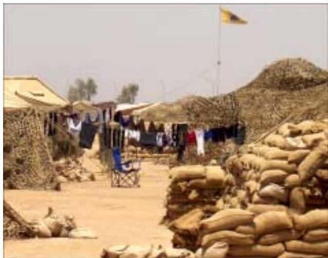
A view of the New Jersey State flag over New Jersey, Southwest Asia.

Last but not certainly not least, we have the proverbial "(deleted) de-