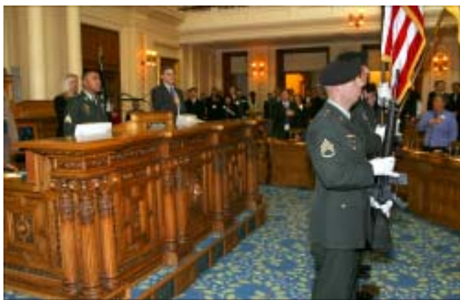
The 150th General Support Aviation Battalion post the colors at the opening of the State Assembly session