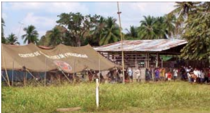
Displaced Panamanians at Boca de Cupe line up for emergency relief supplies flown in by the 150th GSAB.