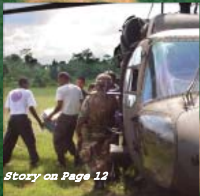
Story on Page 12