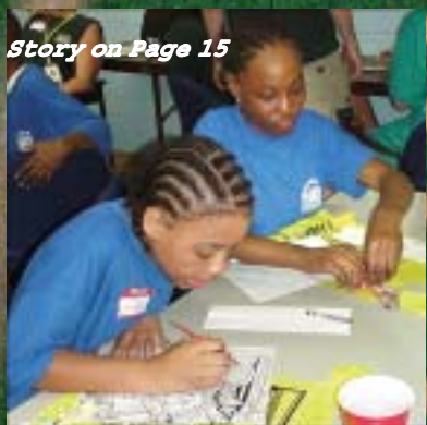
Story on Page 15