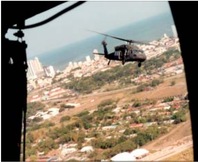
UH-60A Blackhawks flying "loose tail" with the Panama City skyline and the Pacific Ocean in the background.

R ebel forces, humanitarian missions, flying over a place that isn't New Jersey.