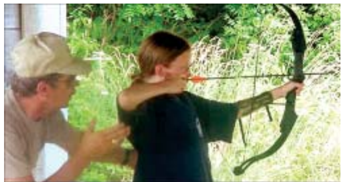
On Target. Like previous Youth Camps, this year's was a hit with both campers and volunteers.