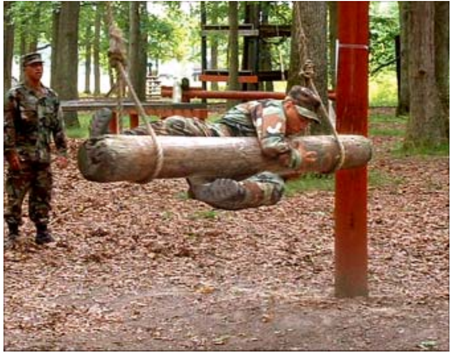
Cavalrymen from the 5th Squadron, 117th Cavalry watch as a fellow Guardsman maneuvers through the confidence course at Fort Dix during the Spur Ride held July 16-17.

Gold Level (five enlistments): all prizes from silver level AND, NASCAR race, garage access, dinner with a race team (Las Vegas Race), Air Assault OR Airborne School and more. In addition, all NJARNG enlisted soldiers receive 3 promotion points for each lead that turns into an enlistment, max 15 points. For more information visit www.virtualarmory.com and go to 2003 Victory Challenge. 🍴