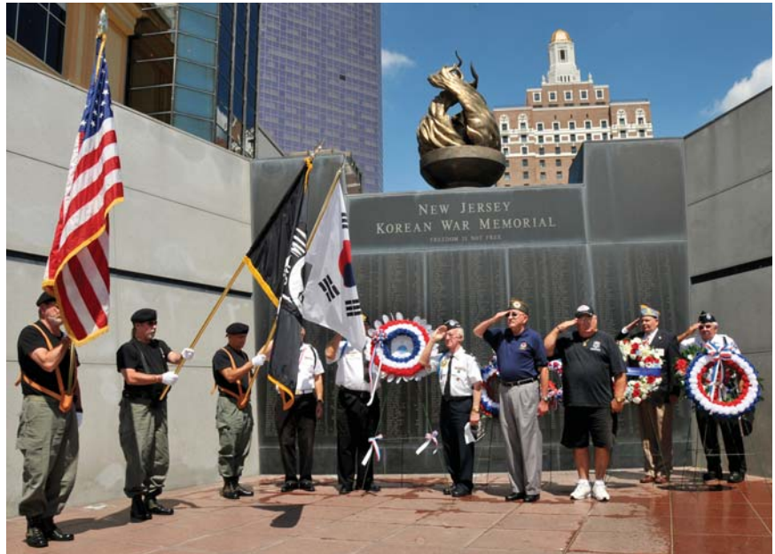
Korean war veterans render honors during the playing of taps during a ceremony commemorating the 58th anniversary of the signing of the Korean War Armistice at the New Jersey Korean War Memorial in Atlantic City, N.J. on July 27, 2011. During the ceremony, eight Korean war veterans were awarded the New Jersey Korean Service Medal.

An interesting finding was that the women Veterans surveyed had new risk factors that were not seen in Vietnam-era women, such as exposure to combat and perceived threat. The authors ascribed that finding to the significantly different experiences of female Vietnam War and Afghanistan and Iraq war Veterans. Women Vietnam Veterans were primarily nurses or clerical staff. In contrast, women Veterans’ roles in Afghanistan and Iraq have substantially expanded, with much higher levels of exposure to combat. Thus, women Veterans in these more recent conflicts may have more in common with their male contemporaries, in relation to PTSS risk, than with their female counterparts from the Vietnam era. However, in terms of post-deploy-