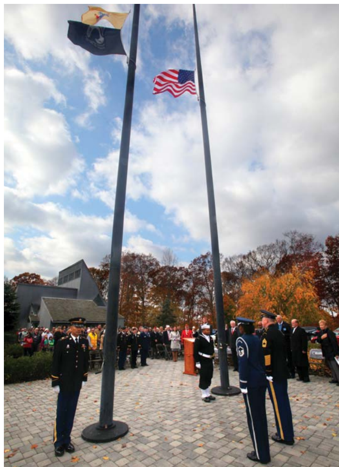
The Brig. Gen. William C. Doyle Veterans Memorial Cemetery was the site for the New Jersey Department of Military and Veterans Affairs' annual Veterans Day Ceremony on Nov. 11, 2011. Third District Congressman Jon Runyan was the keynote speaker joining senior military and veterans' leaders at the ceremony.

Local caregiver support coordinators are available to assist Veterans and their caregivers in understanding and applying for VA’s many caregiver benefits. VA also has a Web page, www.caregiver.va.gov , with general information on spouse telephone support and other caregiver support programs available through VA and the community.