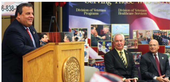
Gov. Chris Christie addresses veterans commanders at the National Guard Training Center at Sea Girt on Oct. 2, 2011.

No matter where your story is told, it has the power to instruct, inspire and reveal fundamental truths about what it means to be an American.