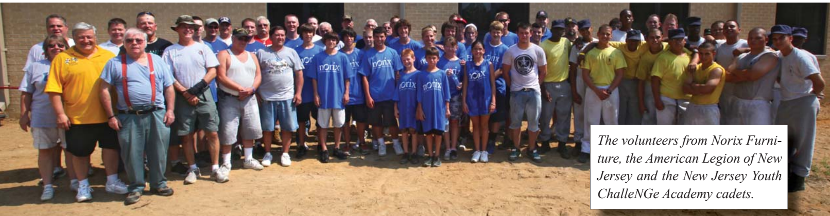
The volunteers from Norix Furniture, the American Legion of New Jersey and the New Jersey Youth Challenge Academy cadets.