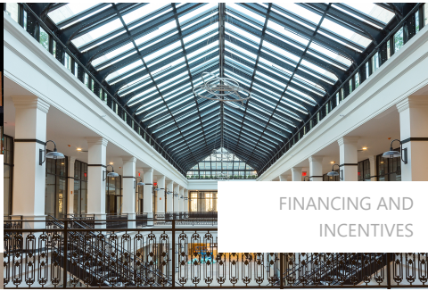
FINANCING AND INCENTIVES