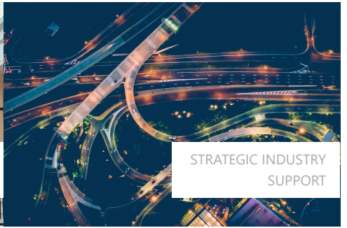
STRATEGIC INDUSTRY SUPPORT