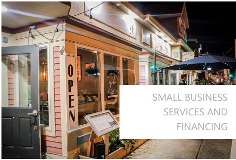
SMALL BUSINESS SERVICES AND FINANCING