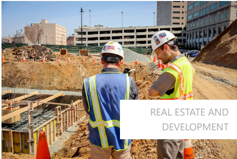
REAL ESTATE AND DEVELOPMENT