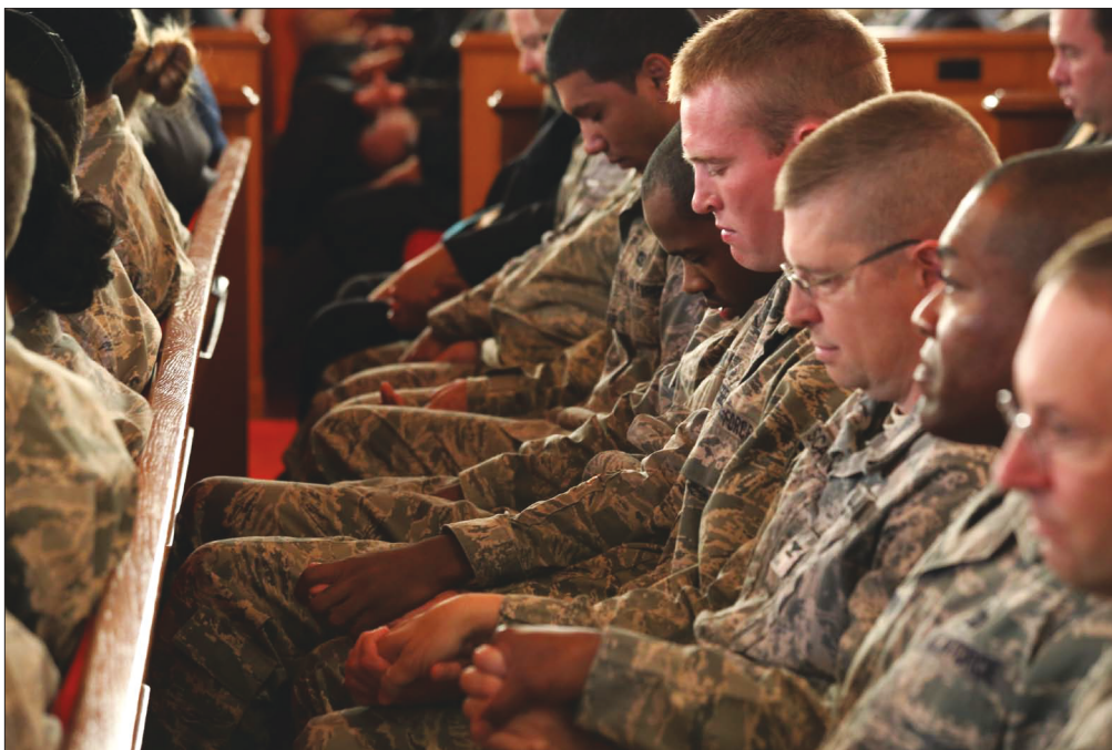
New Jersey National Guard Soldiers and Airmen attend a memorial service in Newark on Oct. 29, 2013 in memory of the 71 people killed by Superstorm Sandy.

The Department's three Veterans Memorial Homes in Menlo Park, Paramus and Vineland remained open and internments continued at the Brig. Gen. Doyle Memorial Cemetery in North Hanover.