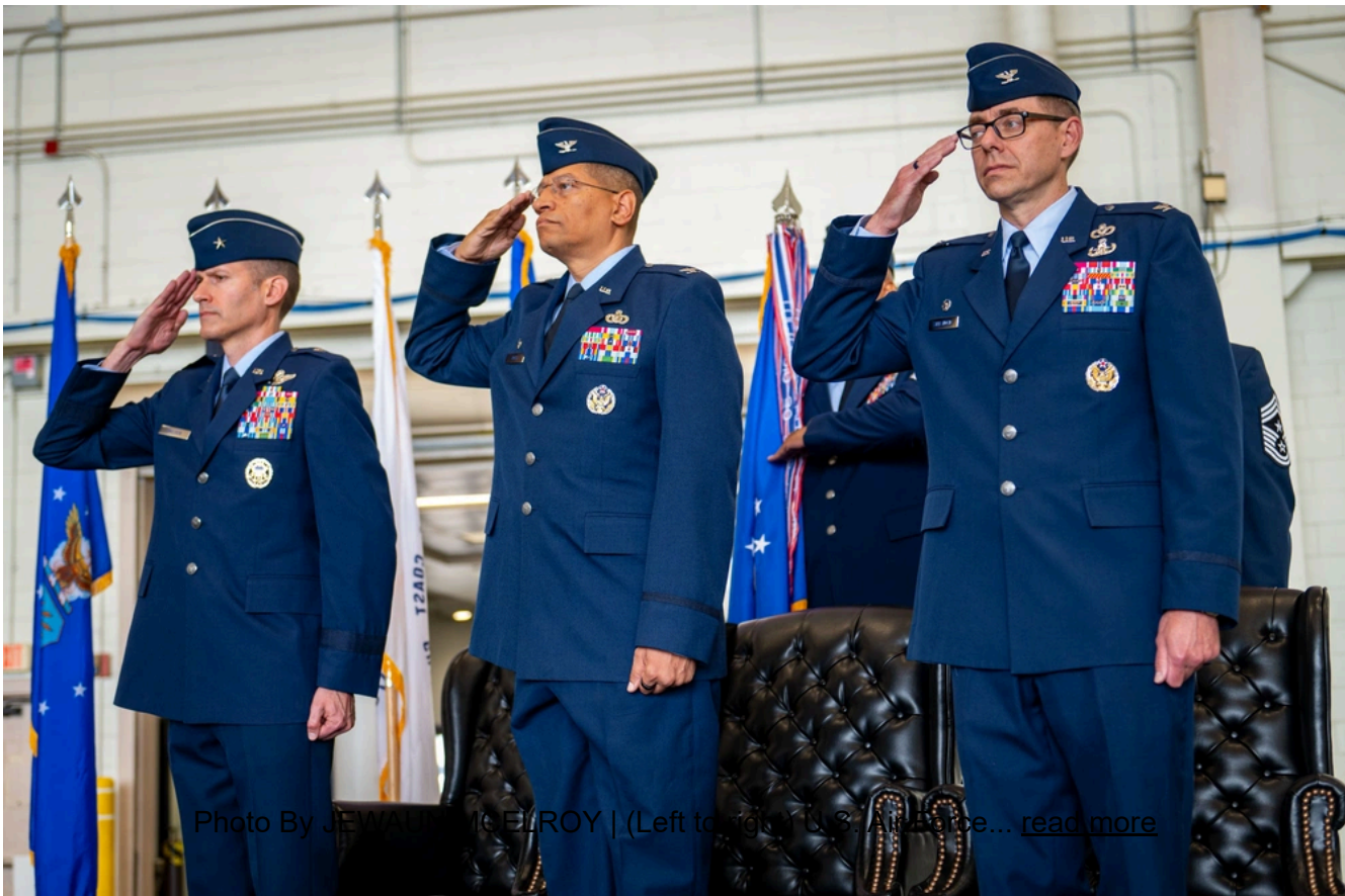
(Left to right) U.S. Air Force... read more