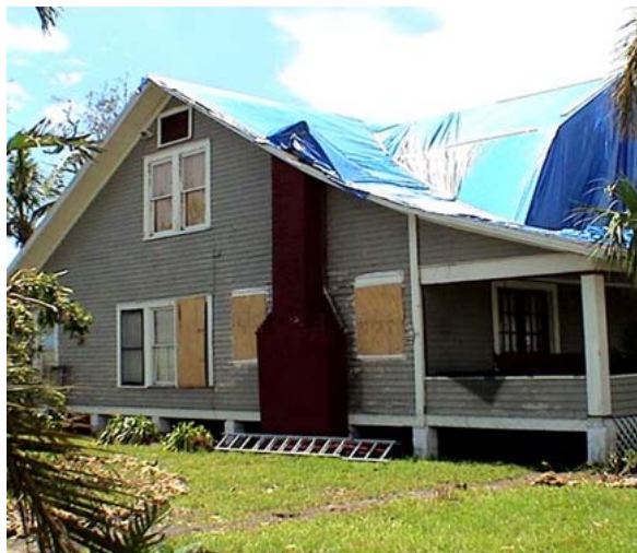
This is an example of a STEP eligible home.