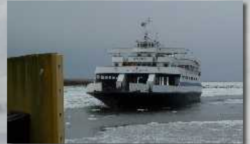
Battling the weather —Delaware River and Bay Authority employees work to keep the Authority's facilities open, even in the worst winter weather. A snow blower throws billowing clouds of snow off the runways at New Castle Airport while a snow plow train keeps the Delaware Memorial Twin Spans open for travelers. Above the MV New Jersey moves through the ice on a cold January morning in the Cape May canal to get to the terminal.