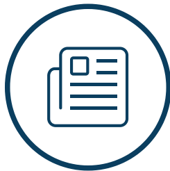
News + Updates