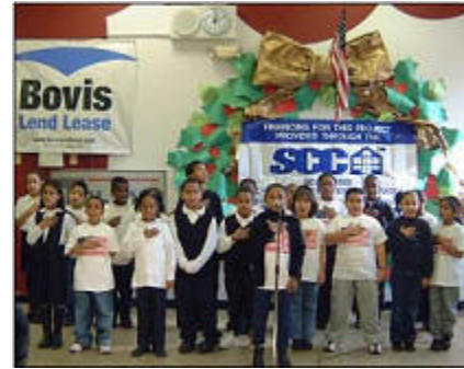
Flag Salute & National Anthem

held a groundbreaking ceremony today to mark the start of construction of a $6.3 million pre-school addition and renovations to the Grant Elementary School No. 7 in Passaic. Educators, state and city officials, community leaders and students as well took part in the event. The project will include the addition of 8 pre-Kindergarten classrooms, a gym and cafeteria and renovations of the existing facility. SCC will manage the construction which it funds in its entirety. This groundbreaking begins the construction of Passaic's third pre-school facility. The first opened on November 18, and the second, now under construction, will open this spring.