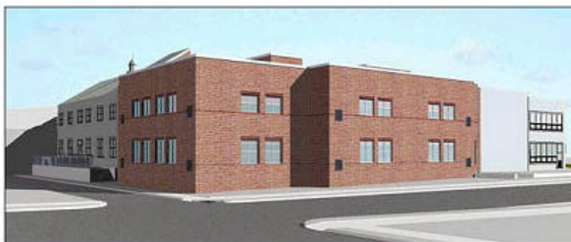
Rendering of Grant School Number 7 Addition

The SCC and Passaic School District officials similarly