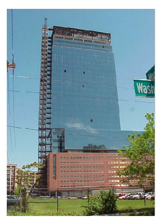
Harborside Financial Center, Plaza Five, 20 Morgan Street, Jersey City