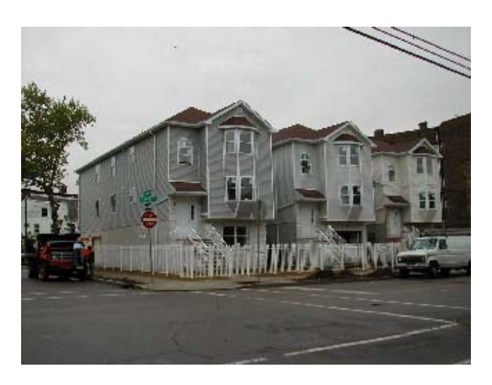
Buy-and-rent housing in Newark's north ward. Home buyers are able to live in one of the units and rent the other.