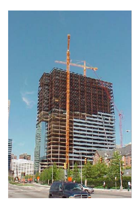
Newport Office Center VII, 480 Washington Boulevard, Jersey City