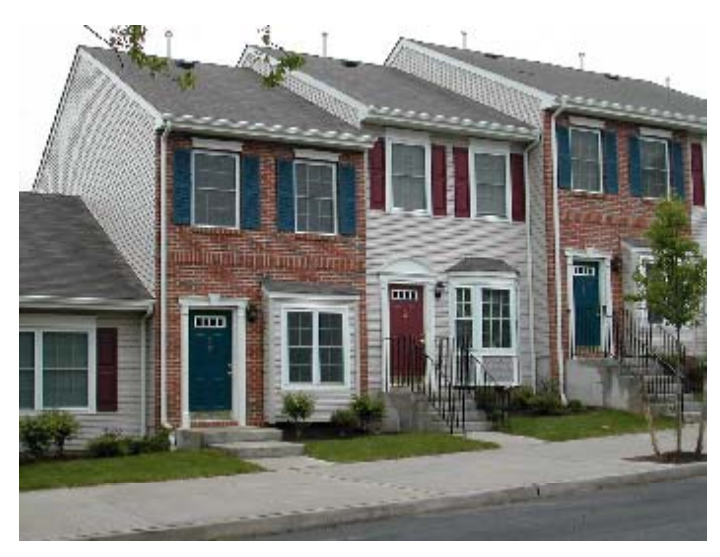
Community Hills Townhouses, Newark south ward