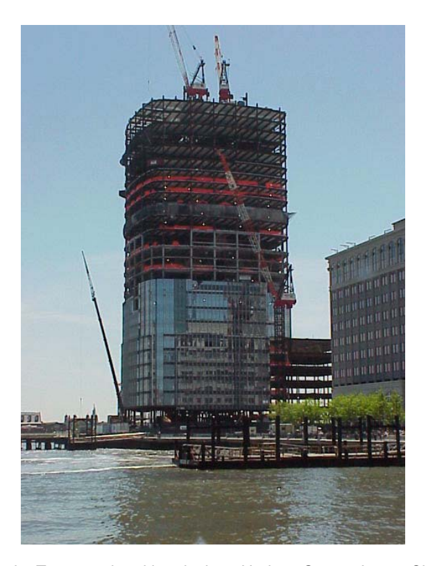
Goldman Sachs Tower and parking deck on Hudson Street, Jersey City

The biggest project in Jersey City was the Goldman Sachs office tower. The 1.5-million-square-foot building sits on the Hudson River waterfront, across from New York City's financial district. The picture below shows the tower which, when complete, will be the tallest in the State. The estimated construction cost reported on the initial permit was $242 million. This is the largest amount on a single permit in the more than six years that the Department of Community Affairs has published building permit data.