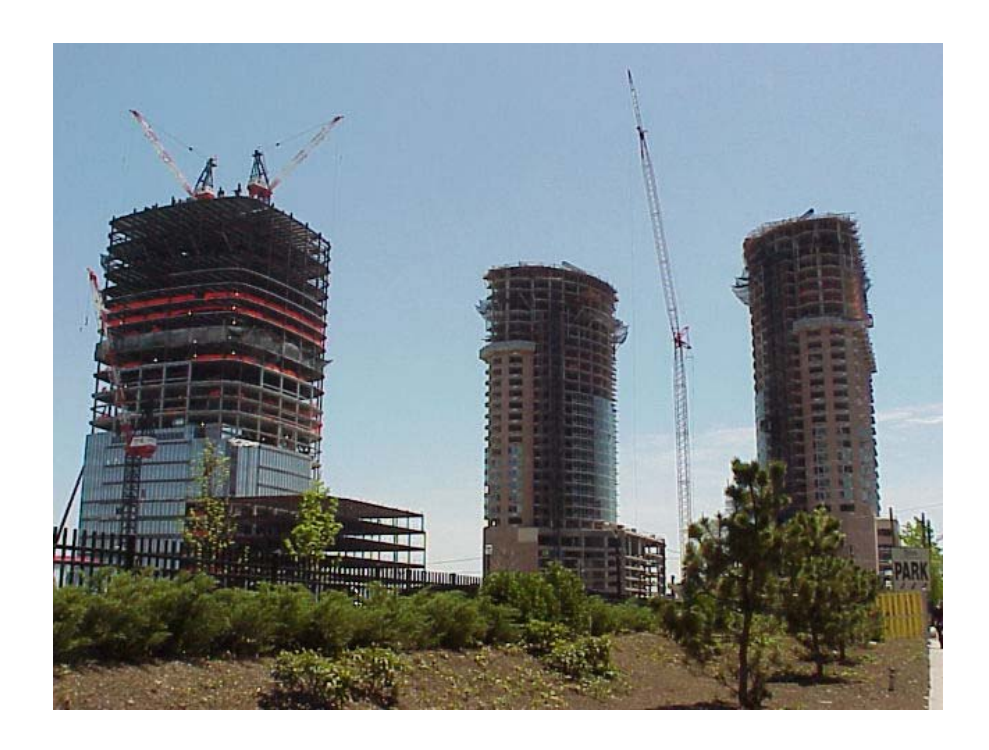
Liberty Towers East and West, 33 Hudson Street, Jersey City. The Goldman Sachs office building is on the left. The two buildings to the right are the apartment complex.

Along with the Goldman Sachs tower, two other new office buildings under construction were Harborside Financial Center Plaza Five and Newport Office Center VII. Plaza Five, a 34-story office building, is on Morgan Street. North of Plaza Five, on Washington Boulevard, is Newport Office Center VII, a 32-story office. All told, both buildings will have nearly 2 million square feet of office space. All of these office developments were well underway prior to the destruction of the World Trade Center on September 11.