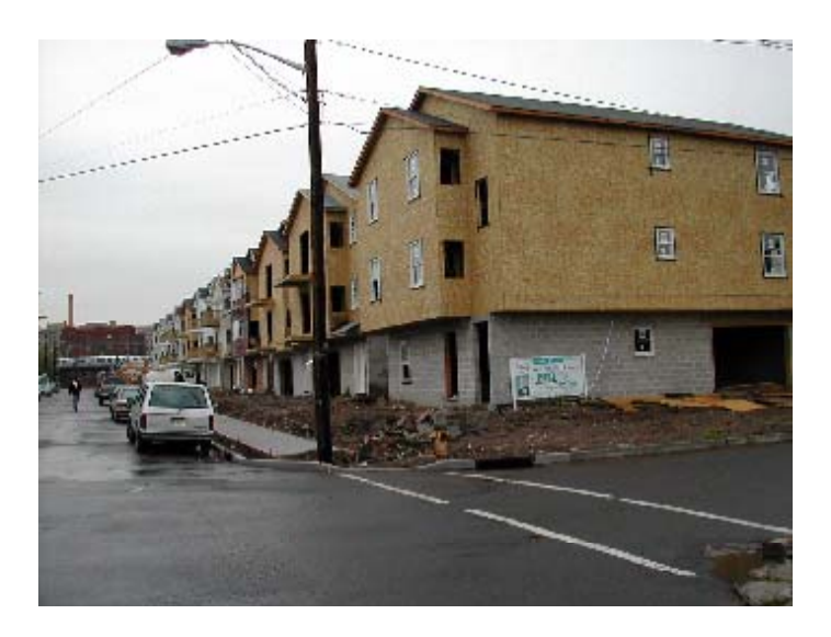
Three-family homes under construction in Newark's iron-bound district