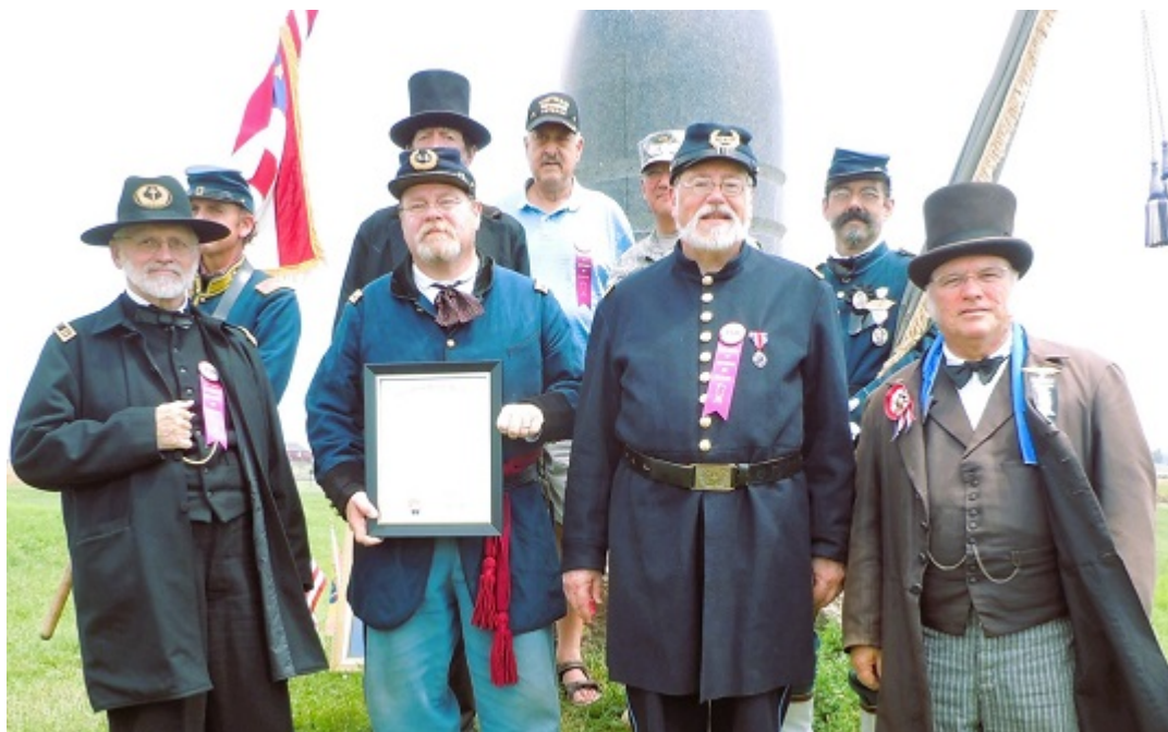
Gettysburg Rededication Team in 2013