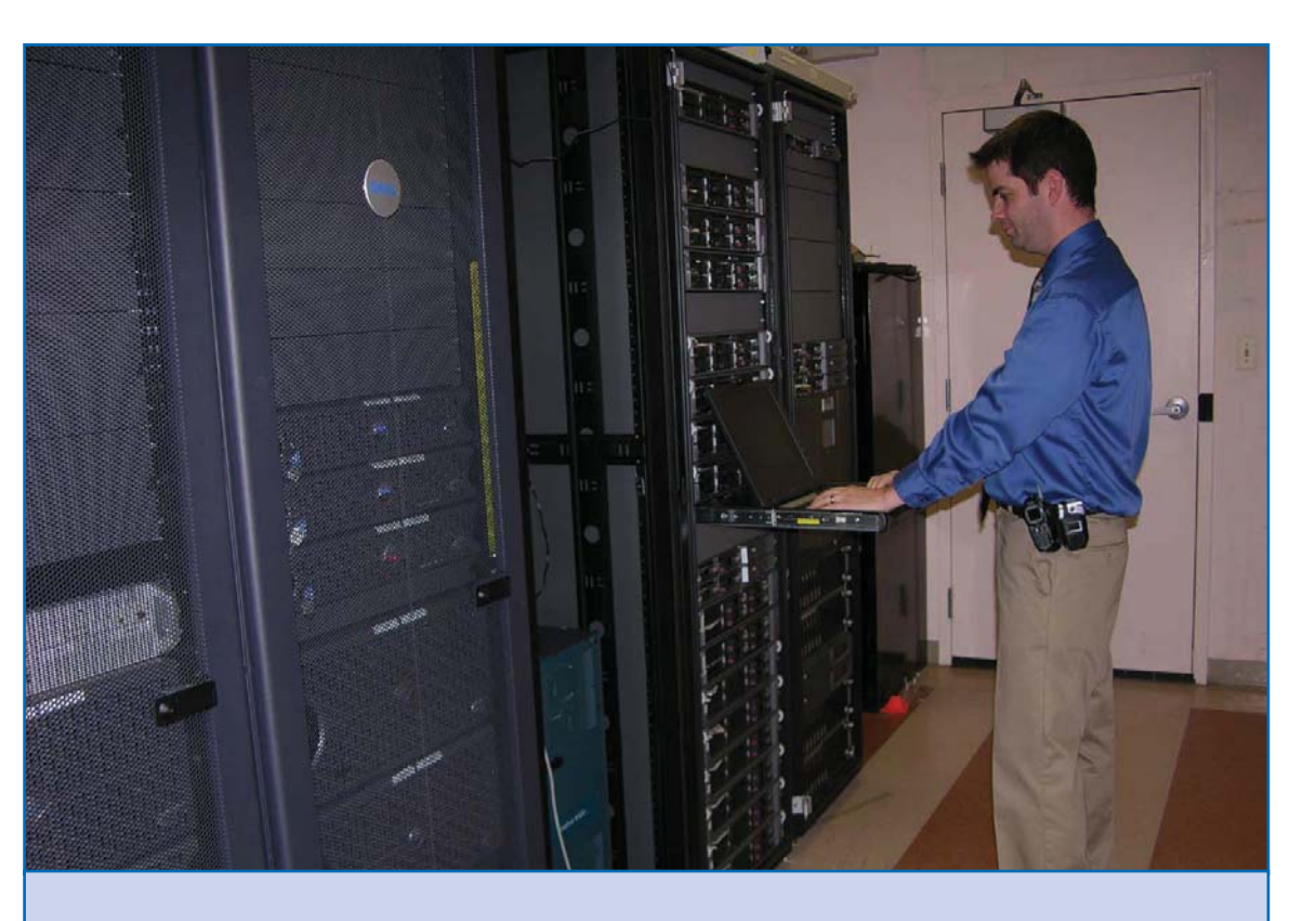
SPB IT staff utilize the latest in technology to support the Board's mission.

bers of the public, as well as other interested law enforcement agencies, a direct link from the Parole Board's website to a directory of incarcerated offenders by name and criminal history and a specific date for their parole eligibility. An interested user can have direct and explicit knowledge of when the