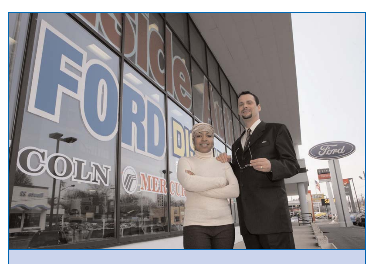
Two successful parolees are employed as salespersons at Hillside Auto Mall in Hillside N.J.

become to an agency that the entire criminal justice community would sit up, take notice of and want to partner with, out of the recognition that the Parole Board is at the cutting edge of a new age correctional in thinking. Today, I am pleased to announce that we laid the have solid foundation