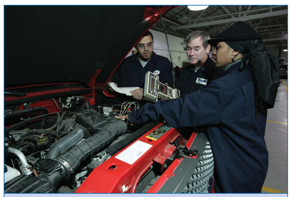
A partnership between the Parole Board, the New Community Corp., the Ford Motor Company and the Hillside Auto Mall has resulted in the establishment of a facility in Newark where parolees are trained for careers as certified automotive technicians.

Community Partnership and External Affairs Unit has developed and maintained partnerships between the Board and community based foundations, corporations, labor unions, non-profit organizations, faith-based entities, community groups and individual volunteers and mentors. Through these partnerships, the Parole Board can maximize and optimize platforms of support in the community so that parolees and other ex-offenders can successfully rebuild their lives and stay out of the penal system. Moreover this optimization can be accomplished at no additional cost to the New Jersey tax-Please read the "Agency payer. Highlights for 2005" section of this Annual Report for more detailed information about the operations of the Board's Community Partnership and