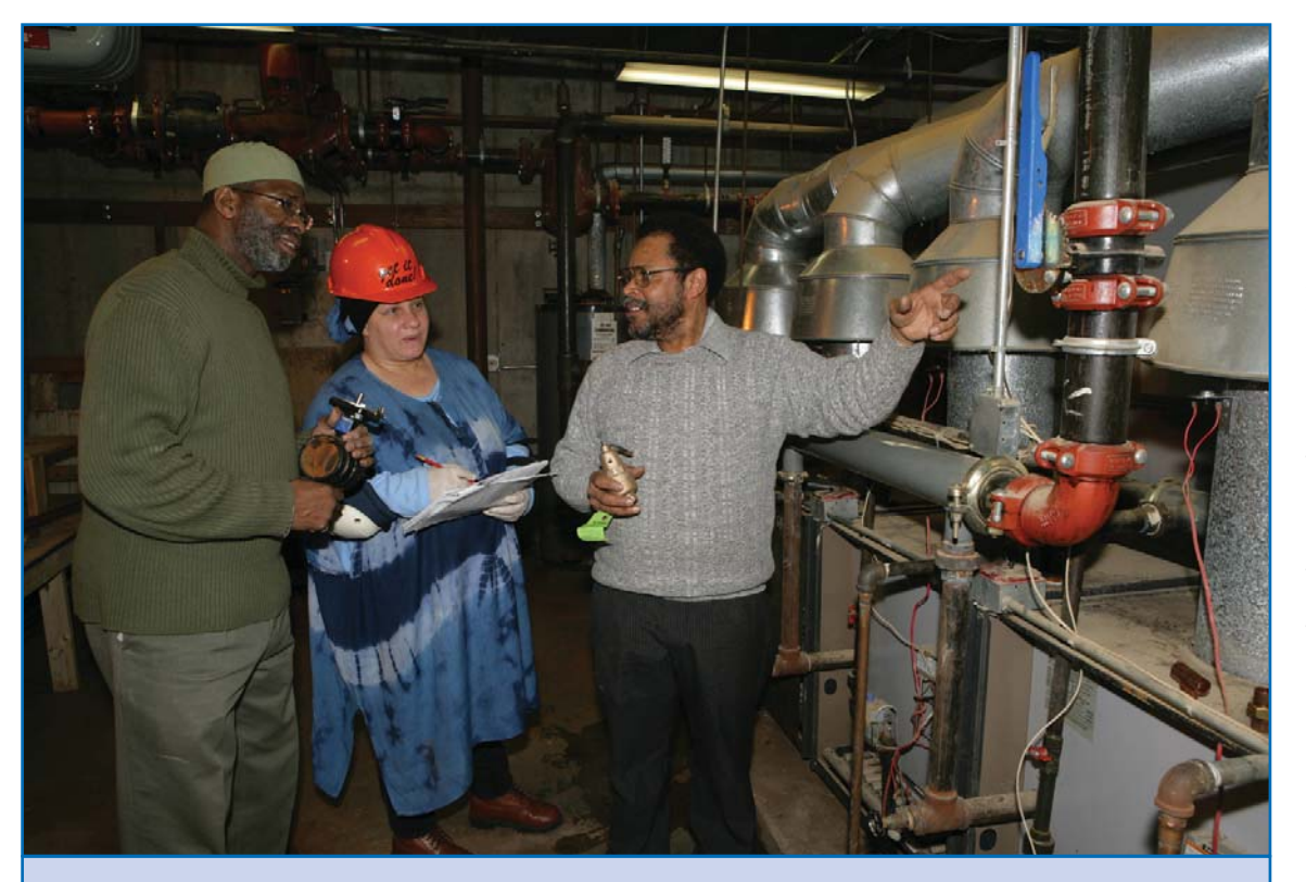
Parolees participate in the boiler room training in order to receive their "Black Seal" certification upon completion of the program.

and realize what that word ought to represent to our citizens. Rather than being a "revolving door" in the process of routinely returning parole violators to prison, the Parole Board is an agency with the potential, skills and personnel to facilitate the successful reintegration