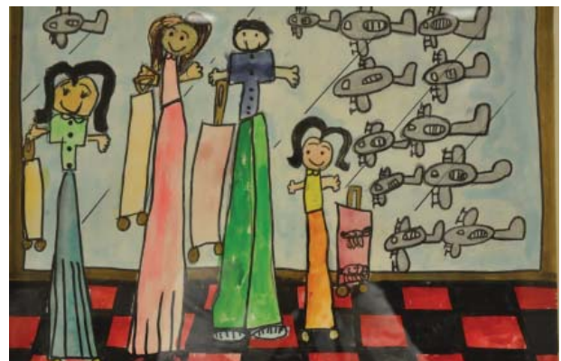
One of the many pictures drawn by children that hang in the Middlesex County Family Courthouse in New Brunswick