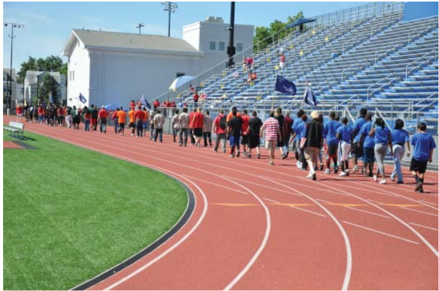
Participants in the 26th annual Judiciary Olympics proceed into Newark Schools Stadium Aug. 15 before opening ceremonies.

The event was hosted by Juvenile Probation Services' Positive Interventions Committee (PIC), which is composed of juvenile probation officers from throughout the state who identify and implement activities and training designed to assist in the rehabilitation of young offenders.