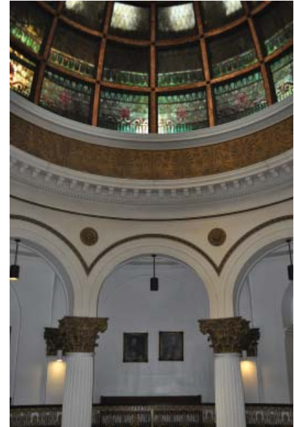
The rotunda in the Passaic County Historic Courthouse in Paterson is shown during and after a major renovation and construction project.