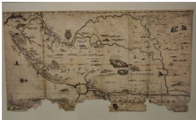
A copy of a map of East Jersey. New Jersey was divided into East Jersey and West Jersey in 1674 before New Jersey was once again a single royal colony after 1703. The East Jersey capitol was Perth Amboy.