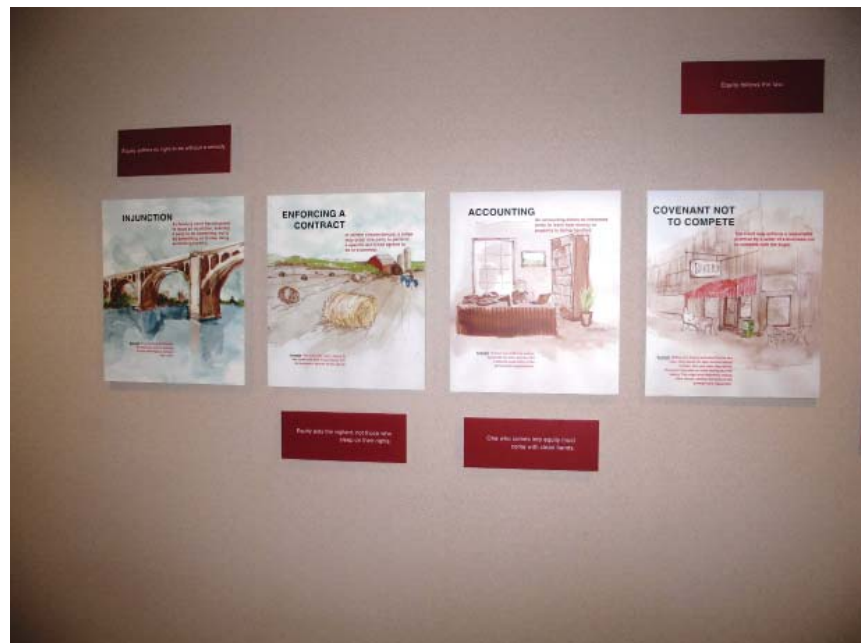
One of the displays includes drawings and definitions of cases heard in chancery court.