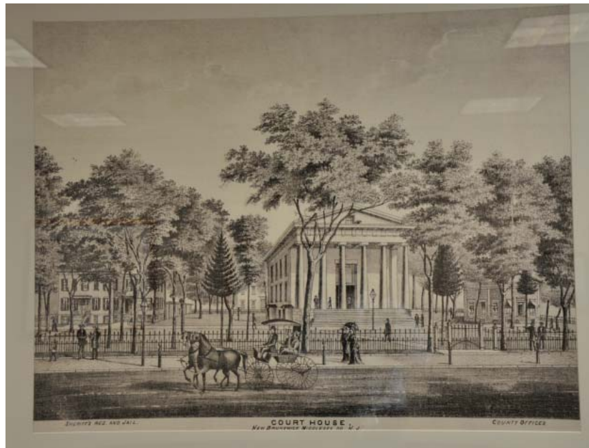
An artist's rendering of the old Middlesex County Courthouse, jail and sheriff's residence in New Brunswick. The courthouse and a previous one stood on the location of the current building.

The New Brunswick exhibit features drawings of an old map of New Brunswick and the first and second Middlesex County courthouses, which stood on the location of the current