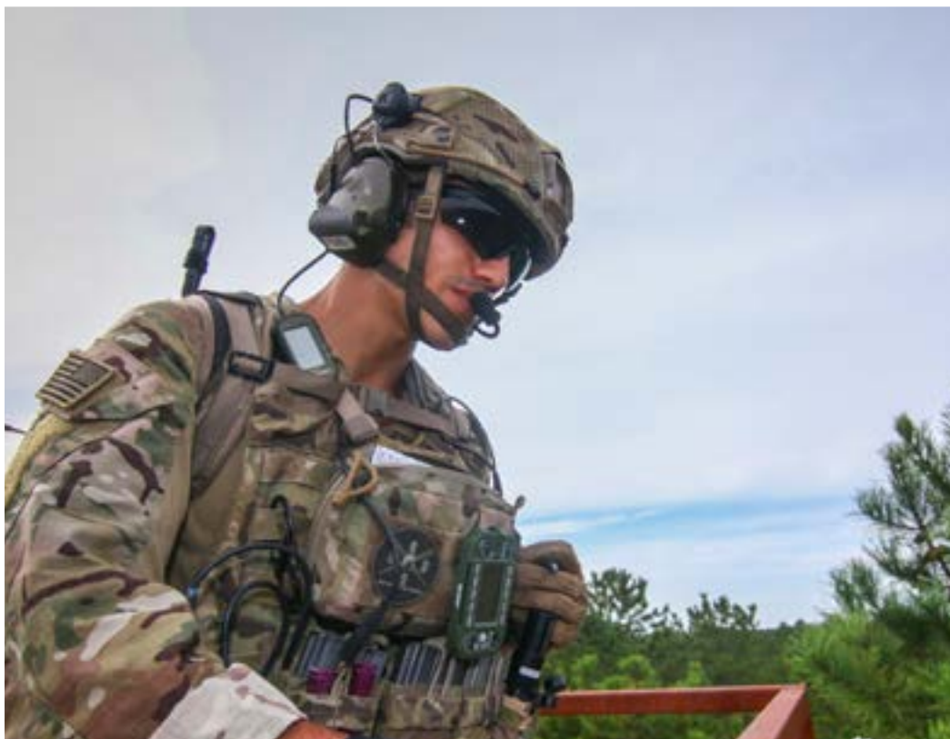
A U.S. Air Force Tactical Air Control Party Airman from the 20th Air Support Operations Squadron communicates with aircraft providing close air support during Exercise Rail Yard, on Warren Grove Gunnery Range, N.J., Sept 21, 2016. Exercise Rail Yard is a joint training mission with active duty Air Force and Air National Guard TACP squadrons, as well as soldiers from the 7th, 10th, and 19th Special Forces Groups.