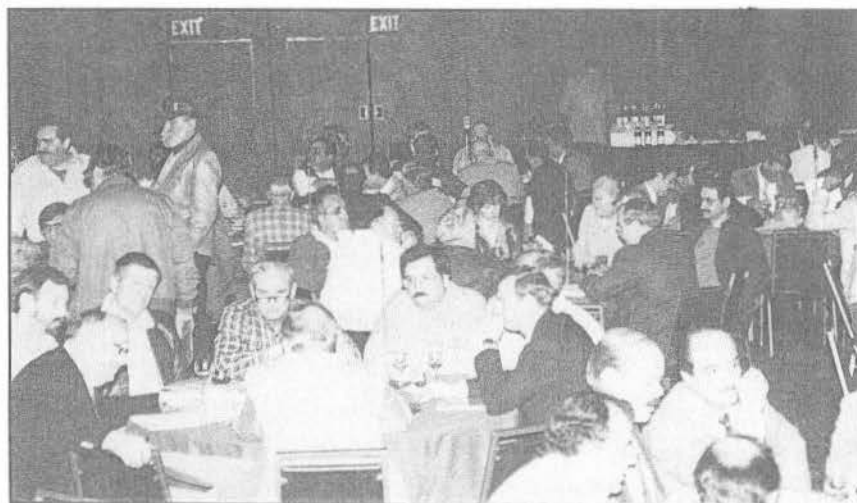
Crackerbarrel, Building Safety Conference, Atlantic City, New Jersey, April 5, 1989