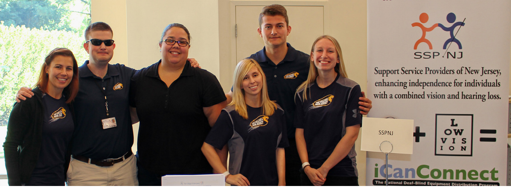
The NJ State Library Talking Book & Braille Center's biennial Fall Festival was held on Saturday, Oct 10 at Grounds for Sculpture, Hamilton, NJ. Answering questions for attendees were members of The College of New Jersey's Center for Sensory and Complex Disabilities.