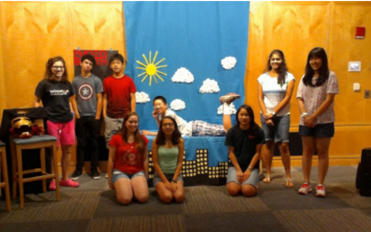
Kids of all ages in public libraries enjoyed the superheroes theme of 2015's statewide summer reading program.