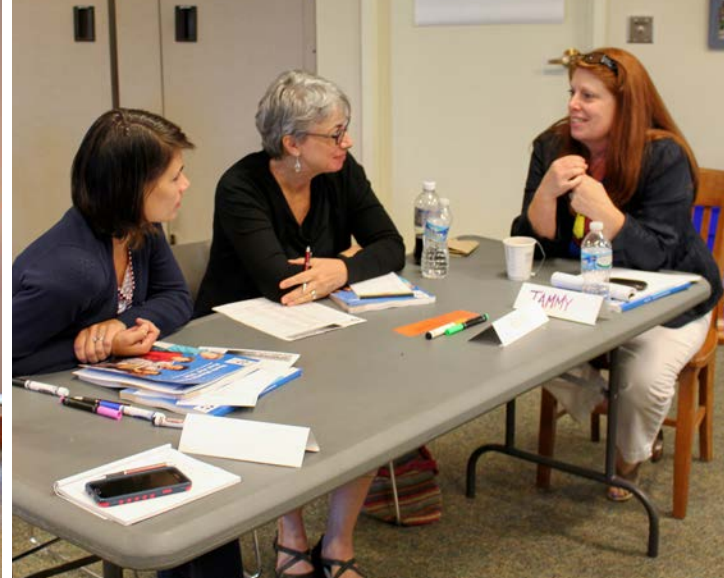
Graduates of the Youth Mental Health First Aid class in Bernardsville.