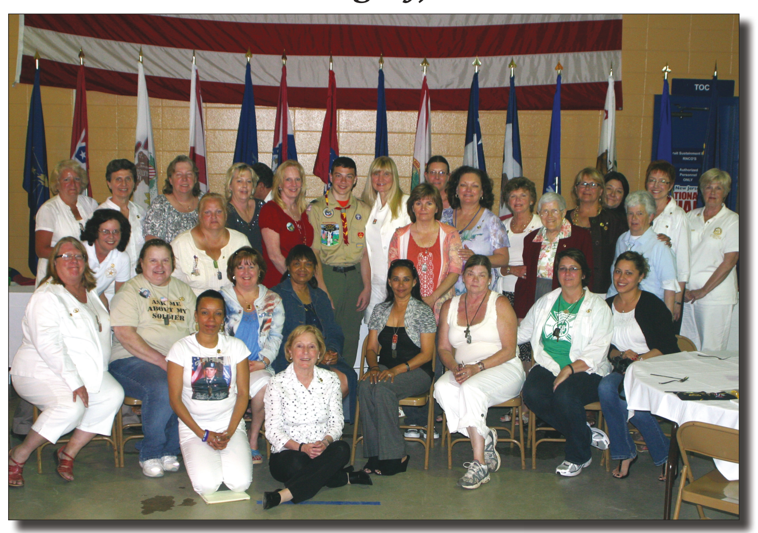
Members of the New Jersey Gold Star Mothers and Families were honored May 21 at a ceremony at the National Guard Training Center in Sea Girt, N.J. The Gold Star Mothers, Inc.

is an organization of mothers who have lost a son or daughter in the service of the country.