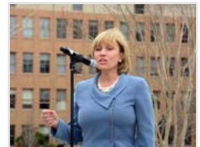
Nobel Laureate Garden Dedication • April 8, 2015 - New Providence