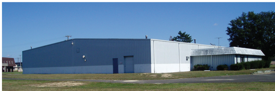
NEWLY TENANTED — Truth Recycling, LLC, is leasing this building, known as the Tomwar Building, at Cape May Airport.

For more information on the construction project, please visit www.drba.net/road_work_info.pdf .