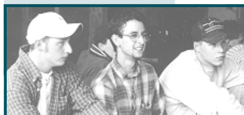
Members of the Hunterdon County Polytech ECHO crew getting briefed.

Information for this article was taken from the Hunterdon County Democrat with their permission.