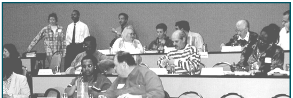
Resident Advisory Board Members meet to formulate PHA Plan.