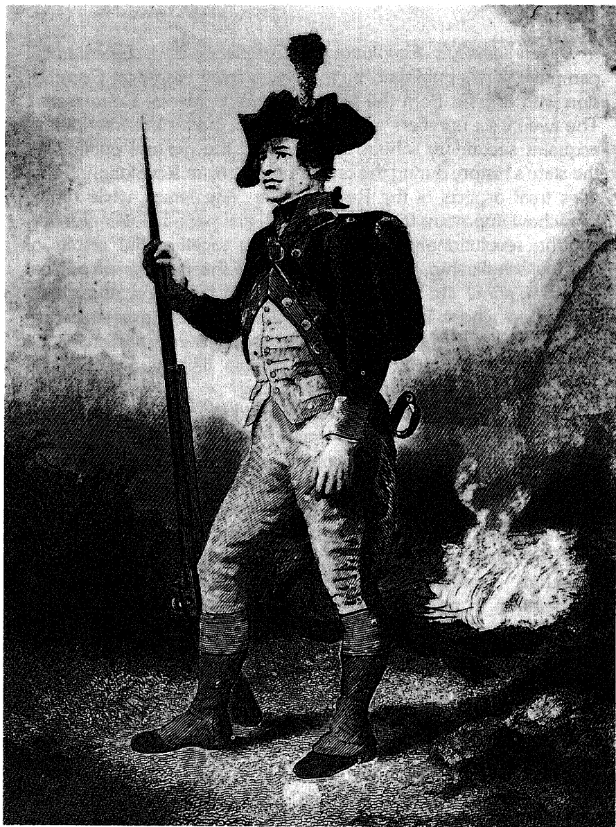
The continental soldier in prescribed uniform. Congress seldom had the money or supplies to keep the army so handsomely uniformed, and homespun hunting garb was more typical.